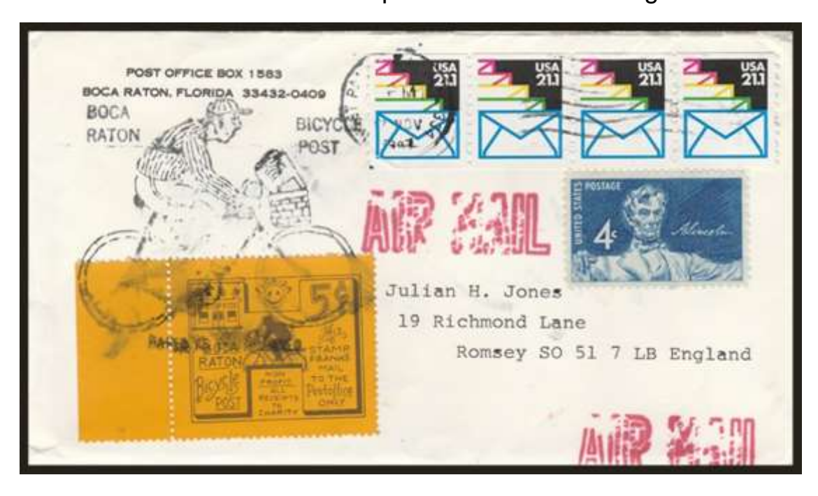
Boca Raton Bicycle Post, Boca Raton, Florida, to Romsey, England, 17th November 1987 Rate: US - GB air mail 44¢ per ½oz, effective 17th February 1985 to 2nd April 1988.

Initially Alfie only carried Pat's mail, but he was eventually allowed to carry mail from the Post Office to the front porch of a disabled neighbour.